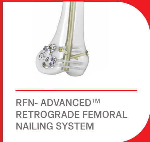
RFN-ADVANCED™ RETROGRADE FEMORAL NAILING SYSTEM