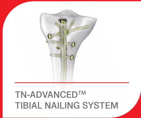
TN-ADVANCED™ TIBIAL NAILING SYSTEM