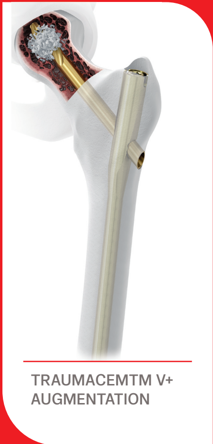
TRAUMACEM™ V+ AUGMENTATION