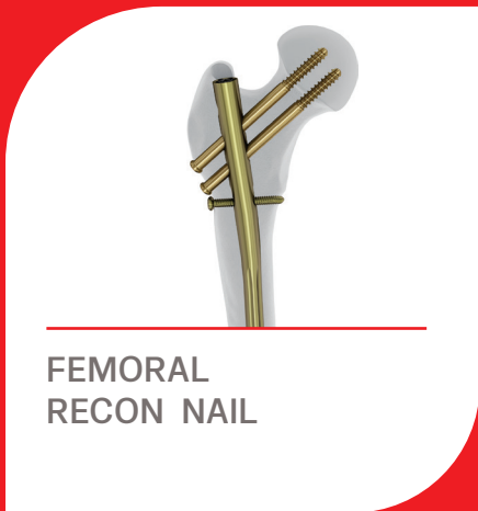
FEMORAL RECON NAIL